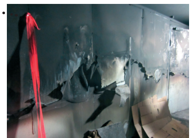
▲ Outer face of ModuSec room