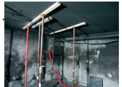
▲ Ceiling collapse in outer room