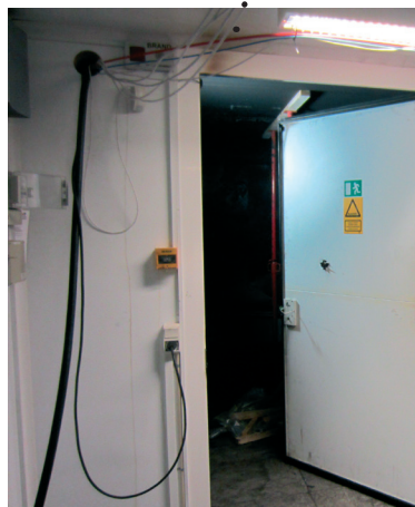
Internal ModuSec room and door suffered no fire damage. New power cable introduced to enable immediate restart.